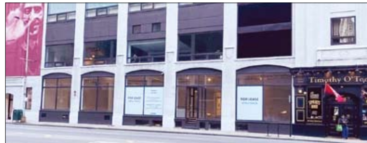
G.P. Green House, LLC, has filed for a Special Use Application to operate an Adult Use Cannabis Dispensary at 620 N. Fairbanks Ct. in Streeterville.