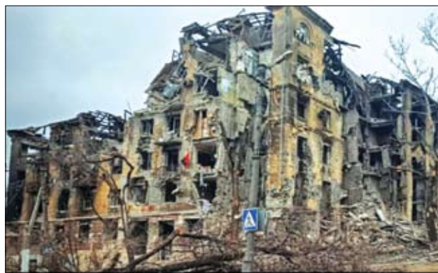
Prior to the Russian invasion of Ukraine in 2022, Mariupol was the 10th-largest city in Ukraine, with an estimated population of 425,681 people. During the Russian siege, the Red Cross described the situation in Mariupol as "apocalyptic."

The Cook County Treasurer's office is hosting a new photography exhibition called "MARIUPOL: Life on the edge of the apocalypse," at their downtown offices running through Aug. 25.