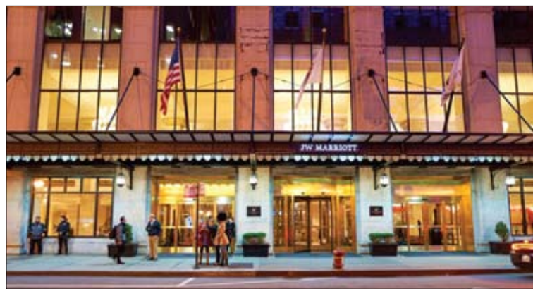
Entryway of JW Marriott Hotel in Chicago.