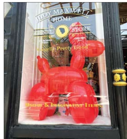
Joan Cusack's Judy Maxwell Home.