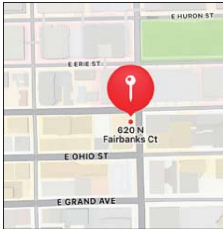
620 N. Fairbanks Court.

Studies show that brain damage can occur at early ages from cannabis use. "I can share with you the concern [that] children at an early age are picking up gummies," said Kostelansky. "There are four large [pre-school and daycare] centers immediately around the proposed location with as