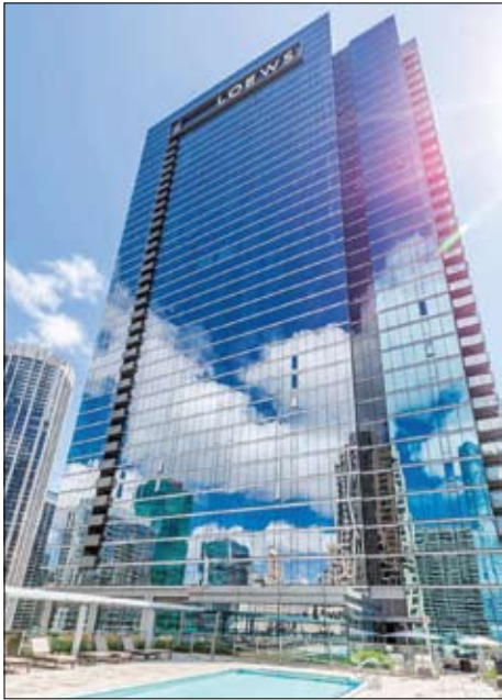
340 E. North Water St.

Downtown landlords are looking warily at a deal that just closed in Streeterville as the seller sold it at a $67 million loss.