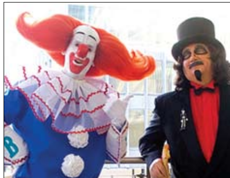
"Bozo the Clown" and Rich "Svengoolie" Koz on the museum terrace that overlooks State St.

June 13, 2012: The MBC officially opens at 360 N. State St. The night before, about 400 people attend a "salute" to the museum that honors MBC's 25th anniversary since opening at River City in the South Loop in 1987.