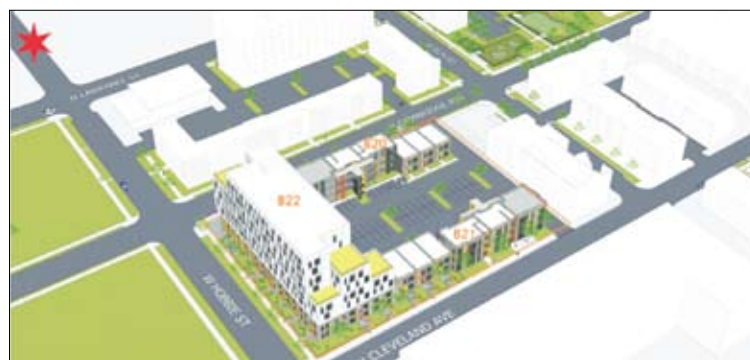
Site rendering of 520 W. Hobbie St. by Holsten Real Estate.

After being renewed in 2021, the extension of the Near North TIF District, is expected to syphon off over $600 million or more in property taxes by 2033 when it expires (if it's not renewed again). The $600 million is on top of the $350 million in taxes the TIF district collected - and that City Hall spent - after being established in 1997.