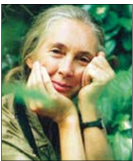
(L) Dr. Jane Goodall. (R) The Clipper Lounge.

CLIPPER: Word is plans are underway to bring back the California Clipper in Humboldt Park, the favorite watering hole that tragically closed in the government imposed pandemic lockdown.