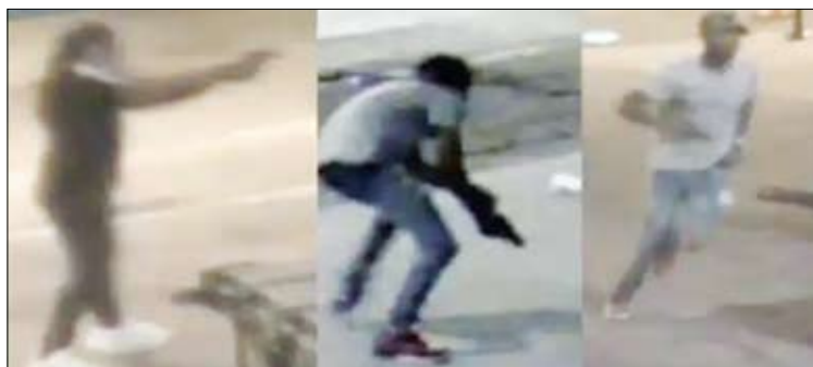
Surveillance images show men involved in the June 6, 2021, shootout at Wacker and Wabash.