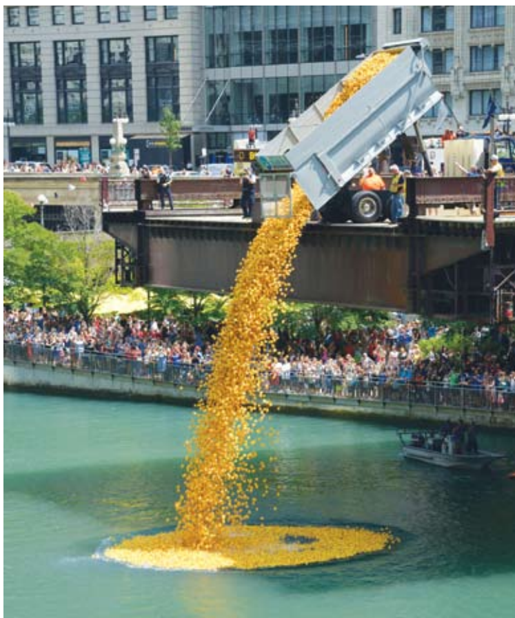
About 65,000 rubber duckies will be dropped into the Chicago River to raise funds for Special Olympics Illinois.

public health organization in the world for the intellectually disabled community, said Winston. SOI is a not-for-profit sports organization that offers year-round training and competition in 18 sports to more than 23,100 athletes with intellectual disabilities and over 13,000 Young Athletes ages two to 7 with and without intellectual disabilities. Yet Winston let me know that although SOI is a sports organization, there's definitely more to it than sports. Its mission is also to focus on better health as well as unification and inclusion among all people.