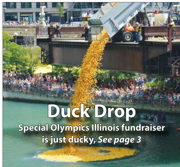
Duck Drop Special Olympics Illinois fundraiser is just ducky, See page 3