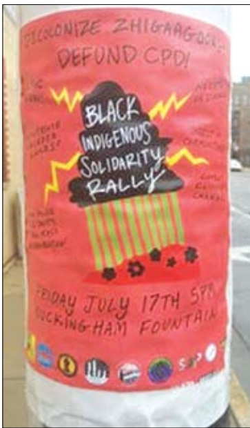
Poster in Wicker Park.

They also came armed with the knowledge that the mayor will not