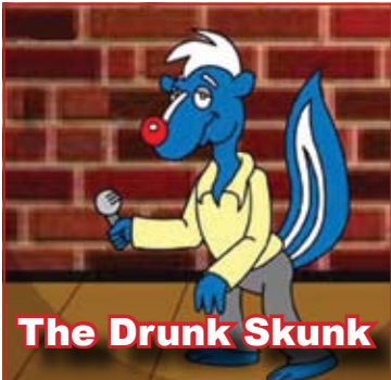
The Drunk Skunk Funny cartoon video about an intoxicated skunk trying his hand at stand-up comedy. View at: https://www.colemantoons.com/skunk.html