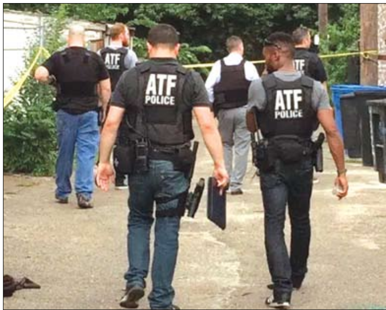
Chicago police and ATF agents work a crime scene in 2017.