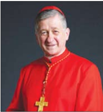
Cardinal Blase Cupich