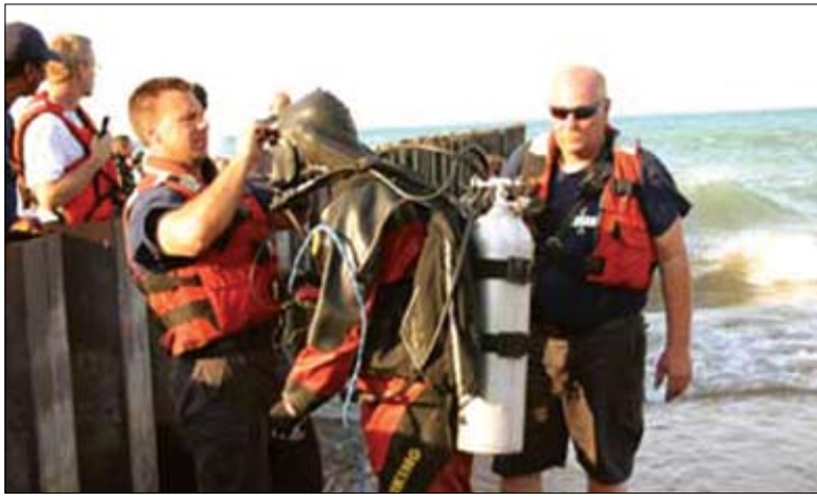
Divers searching Lake Michigan at Lunt Avenue a few years ago after a teen disappeared into the water and drowned.

And now, all these years later, after living on the beach for the last four decades, it has almost become a yearly ritual to see a massive search taking place for