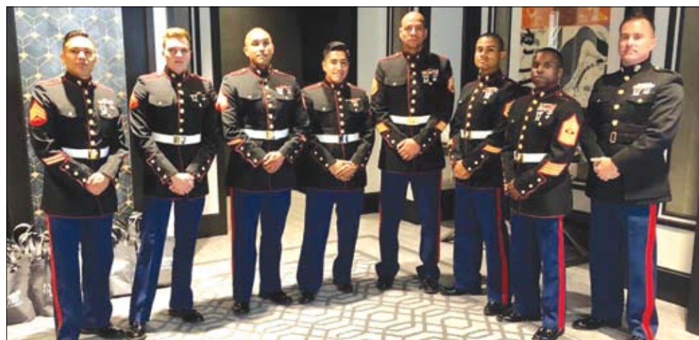
U.S. Marine Corp.