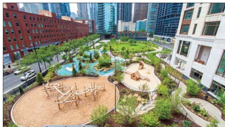
451 E. Illinois St.

The busiest day on State St. during Lollapalooza this year was on Friday, Aug. 2. The busiest hour was 5 p.m. on Wednesday, July 31. The busiest stretch of State St. was between Madison St. and Monroe St.