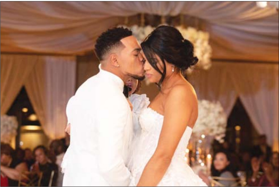
Chance the Rapper and Kirsten on their wedding day in March.

For more housing news, visit www.dondebat.biz . Don DeBat is co-author of "Escaping Condo Jail," the ultimate survival guide for condominium living. Visit www.escapingcondojail.com .