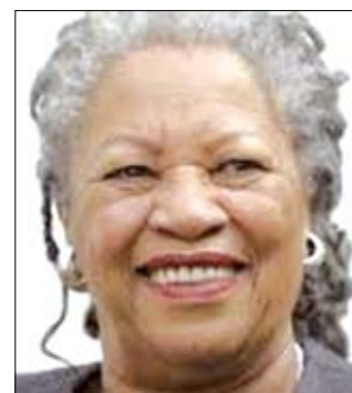
Nobel Laureate Toni Morrison.