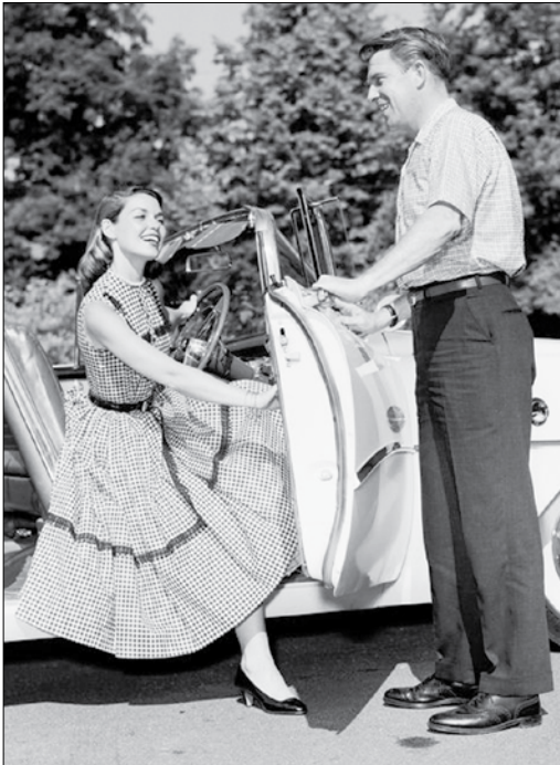
Good manners cost nothing.

SAY "THANK YOU." Say it out loud. Are we conscious of expressing gratitude to others? A small thing. But "thanks" is too often omitted when we try to express our measure of gratitude for any number of kindnesses big and small. In a crazy and liquid urban world we could use the acknowledged connection to the care of others. And acknowledge it. We