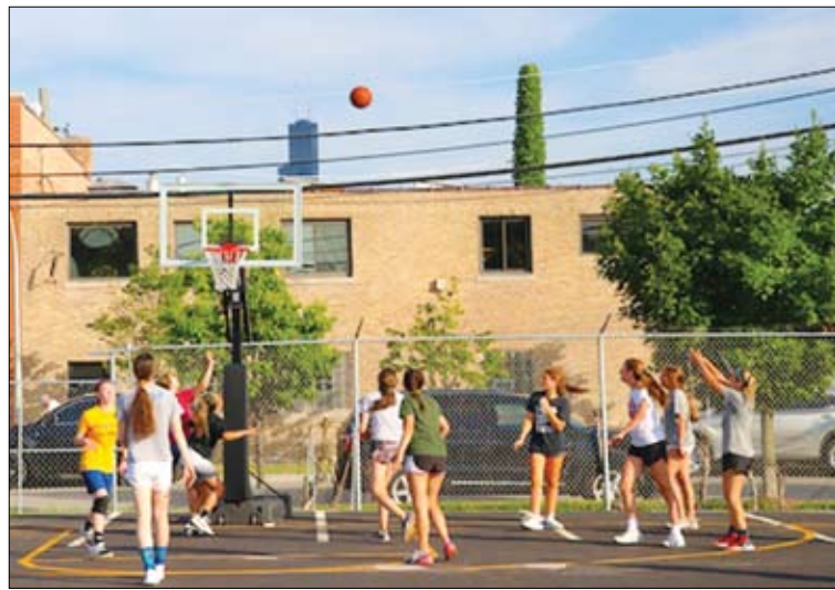
Players on the 17U Flow Academy AAU basketball team practice at Fleet Fields in Bucktown. Flow suspended play from mid-March to late June because of the pandemic but resumed upon Phase 4 reopening and participated in several tournaments this summer.