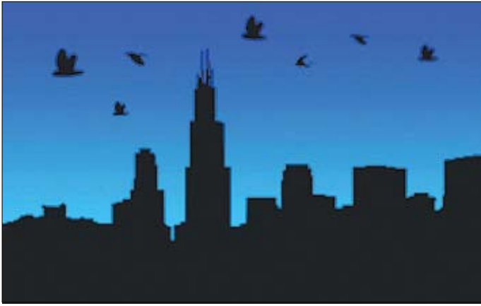
Join light reduction efforts to make Chicago a safer place for migrating birds.

The western shore of Lake Michigan is a super-highway of sorts for migratory birds. And birds don't really understand about large cities with large buildings with windows and glass, ... and so birds will smack into them. It's a big problem for the birds. The light attacks them and their crashes into the windows disrupt their migration, many times resulting in death and injuries. Research has shown that birds