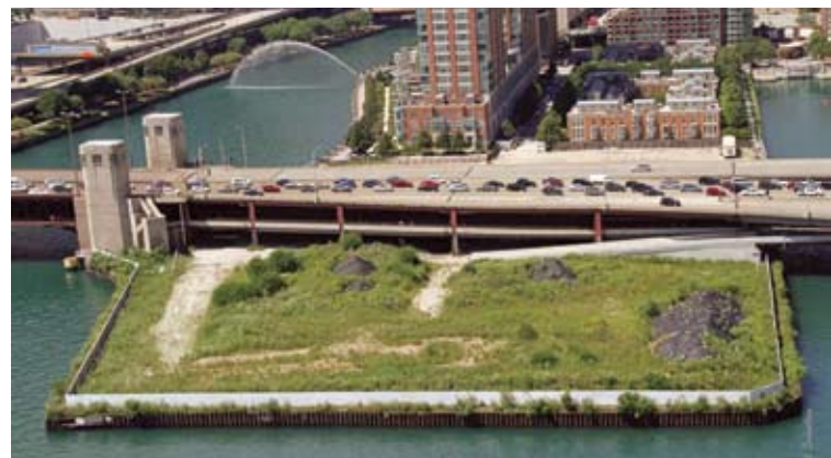
The location of the future DuSable Park at 400 N. Lake Shore Dr.