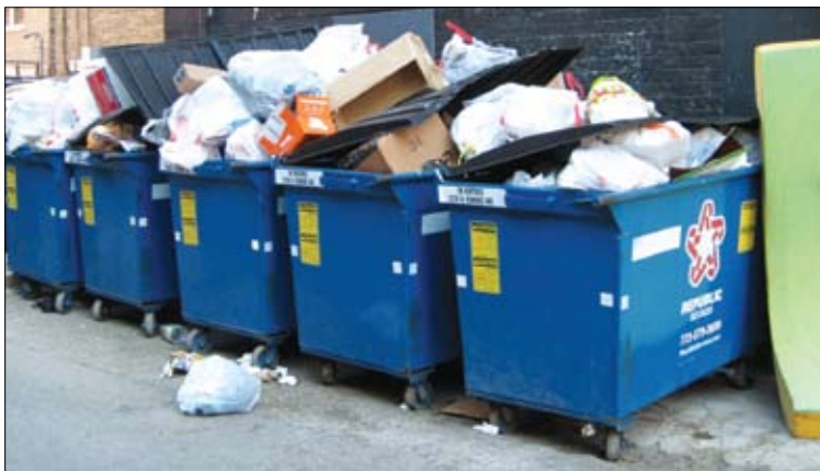
An open invitation to the rodent colony are overflowing dumpsters and trash on the ground. According to the Dept. of Streets and Sanitation, exposed garbage is the primary reason rodents proliferate.

Yes, Chicago residents are reporting many more residential sightings of rodents during the past few months. With fewer restaurant dumpsters to feast on during the pandemic lockdown,