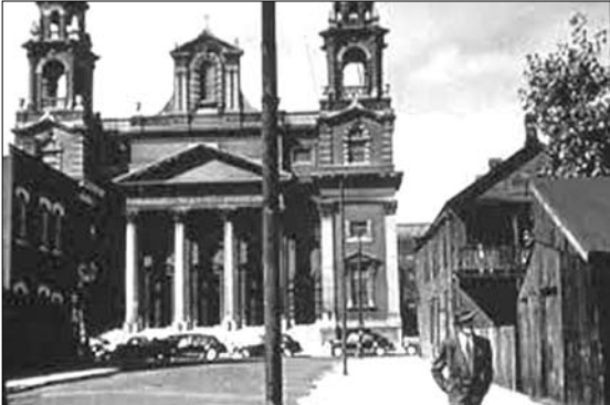
Chicago’s Polish Community is stunning in black and white.