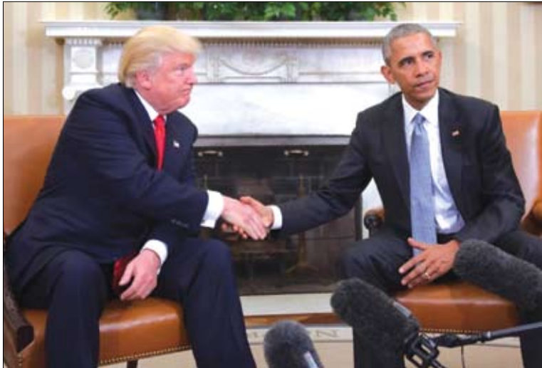
President-elect Trump shakes hands with President Obama.

However, some of the newly built homes may be log cabins and domiciles erected in trees, while others will likely be mobile trail-