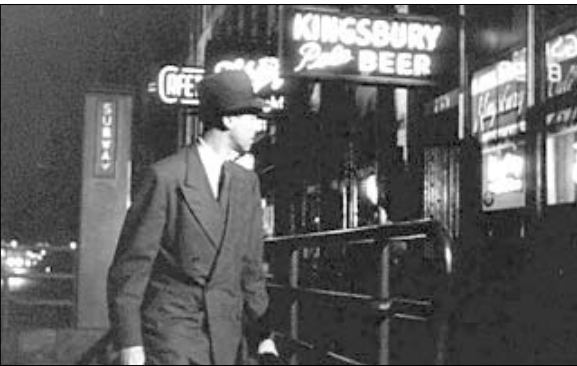
Chicago’s gritty under belly glows for the camera.