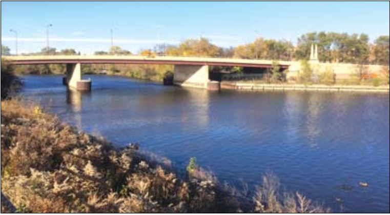
While there are nearly 27 miles of riverfront trails throughout the city, there are still about 14.8 miles of river with no trail. The purpose of the plan is to fill in the gaps. In places where no land is available, some trail segments will actually float on the river, including a proposed segment from Addison St. to Irving Park Rd.