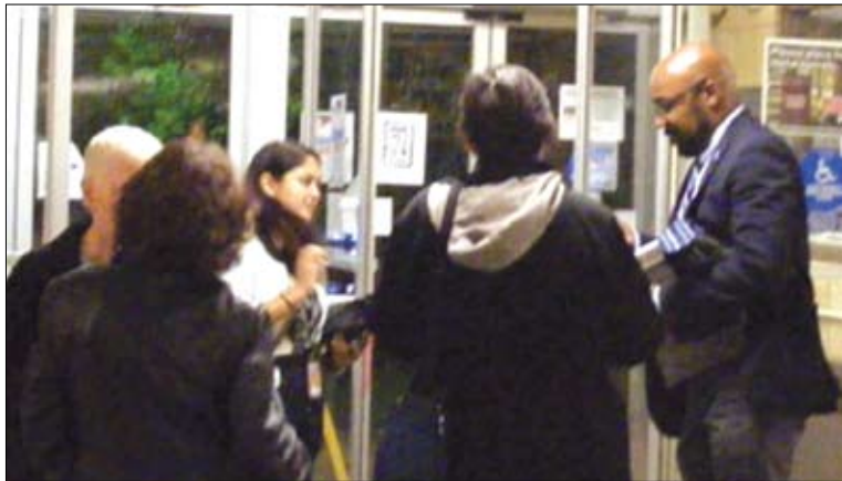
State Sen. Kwame Raoul confers with elected school board supporters after a Nov. 2 rally at Horner Park.

But Mayor Rahm Emanuel's office has resisted calls for an elected school board fearing that the election would be stacked by CTU-backed candidates who would use union muscle and money to get union-friendly candidates elected to a majority of the board slot in a low turnout race. The mayor claims that an elected board could jeopardize the futures of CPS students by injecting politics into the