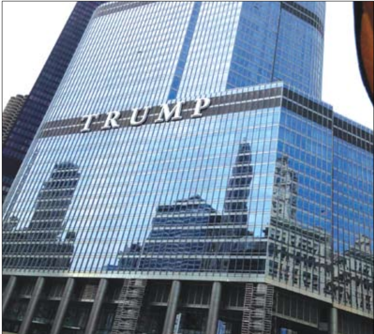
Trump Tower at 401 N Wabash Ave.

Now, Emanuel may have to put a new, more presidential sign in its place. Political insiders say Trump Tower soon will become the Midwest White House because the president-elect likes to reside in his own private suite in his own hotel when he is in town.