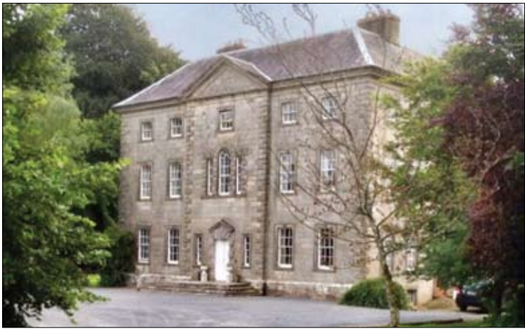
Roundwood House in County Laois, Ireland.

Buttercream cakes make up dessert before the Edith Piaf and Bach begins. I'm glad to reflect on this, to take time to measure