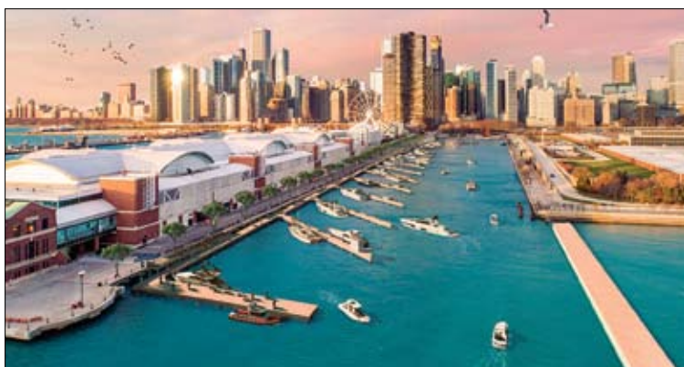
Rendering, updated in November, of a new marina planned for the north side of Navy Pier.

CDOT Cmsr. Gia Biagi said she denied the permit because the marina posed "unacceptable security risks" due to its proximity to the Jardine Water Treatment Plant, though not detailing those risks, according to NPM