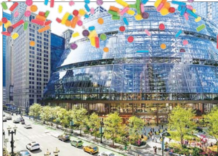
of what the Thompson Center will look like after a renovation that will start early next year.