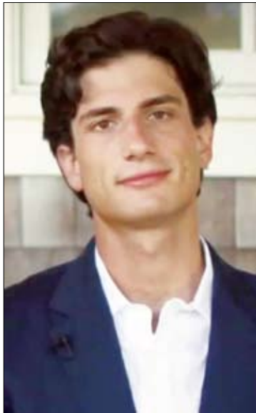
John Bouvier Kennedy Schlossberg