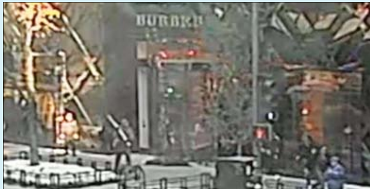
The attacker hoists a large log onto his shoulder after striking a woman with it on the Magnificent Mile on Nov. 13.

Video shows Chicago man attacking woman with a log on the Magnificent Mile